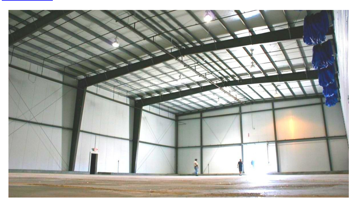
HCA Studios' primary facility includes 77,000 square feet of stages with ceilings up to 32 feet.