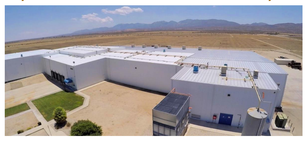
Production oasis: HCA Studios in North LA County offers lots of space and privacy within the Secondary Studio Zone.