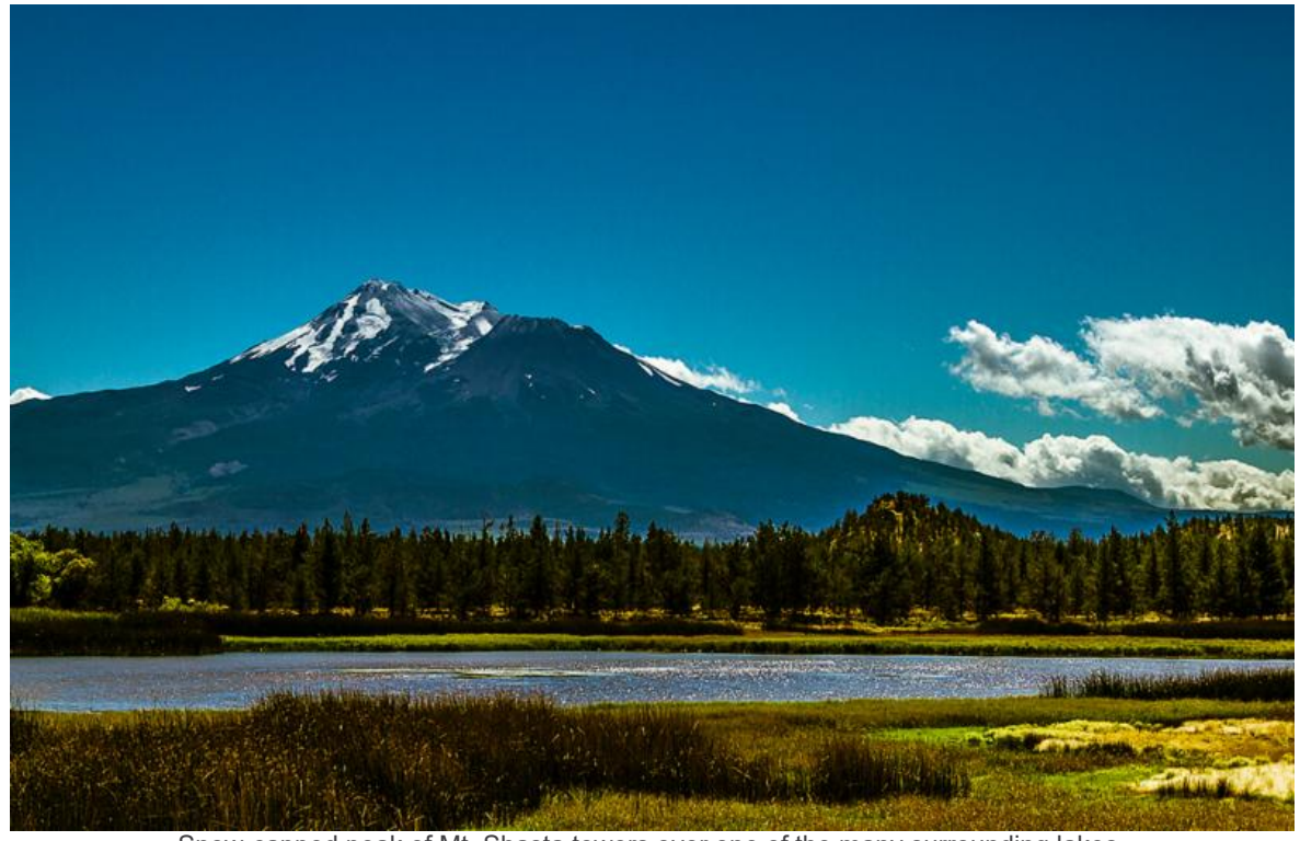
Snow-capped peak of Mt. Shasta towers over one of the many surrounding lakes.