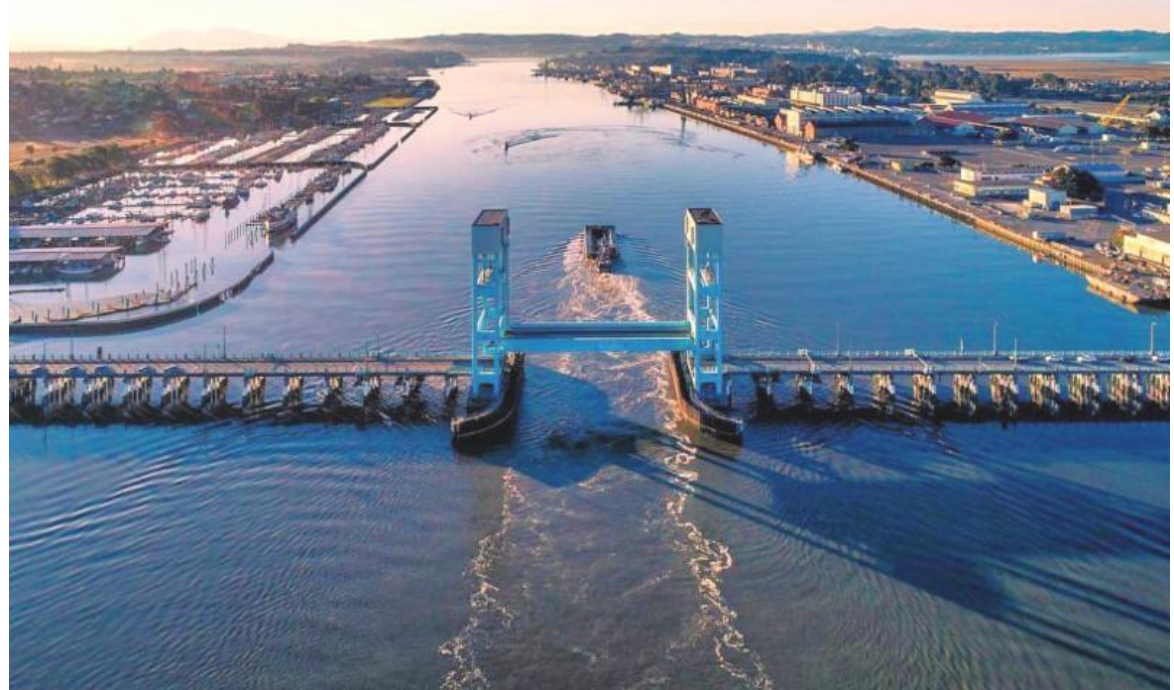
Mare Island Causeway Bridge over the Napa River connects the city of Vallejo to Mare Island (on right). The bridge has appeared in many projects, including the Netflix series 13 Reason Why .