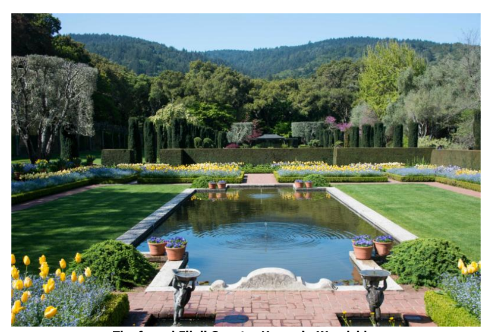
The famed Filoli Country House in Woodside.