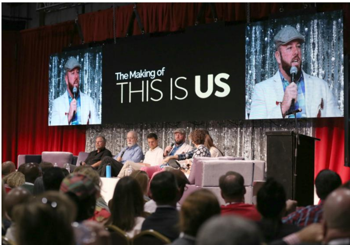
"The Making of 'This is Us'" panel at last year's conference included cast and crew members from the hit TV series.

See photos from past conferences on Flickr .